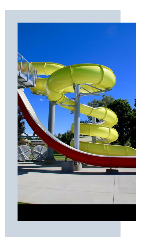
Memorial Pool Slide