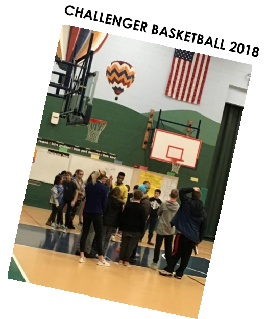
CHALLENGER BASKETBALL 2018

Valentine Card-Making and cookie decorating stations were set up as well as the movie "Trolls" for the kids to enjoy.