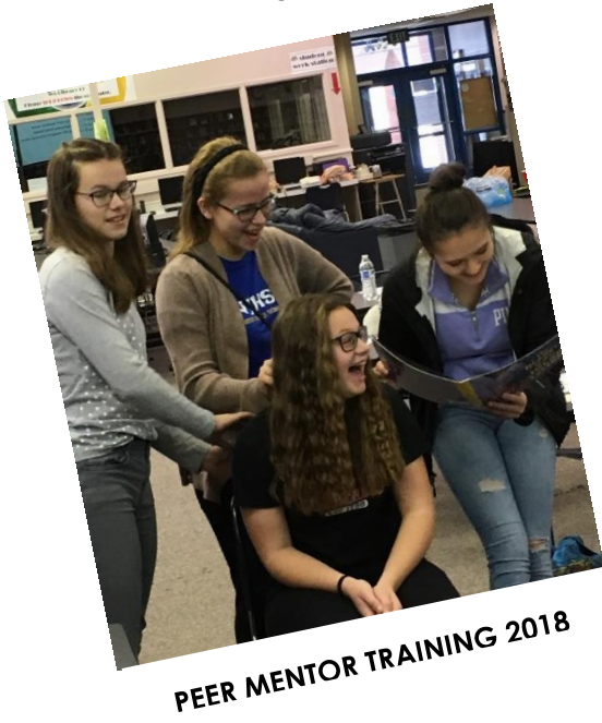
PEER MENTOR TRAINING 2018